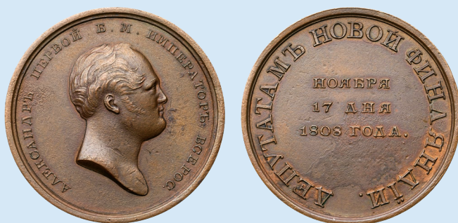
3030 Award Medal to the Deputies of the New Finland. Bronze. 42 mm. Unsigned. (By Shilov). Bit H611 (R3). Bust of Alexander I right / Legends. Rare.