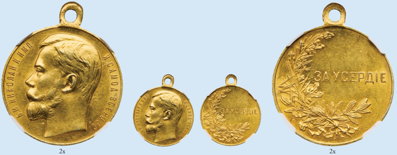
3045 Medal for Zeal. GOLD. 17.95 gm. 28.4 mm. Bit 1119.1 (R1), Diakov 1138.6 (R1). Nicholas II head left / Legend: "ЗА УСЕРДІЕ".

Condition: Authenticated and graded by NGC AU 58 (# 6488870-008). Choice almost uncirculated.